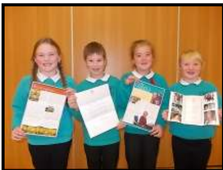
Letter from the Queen thanking us for our Jubilee wishes!

We also like to celebrate the achievements that our pupils have out with school too. These are celebrated at our weekly assembly and then on our achievement board in the front entrance of the school.