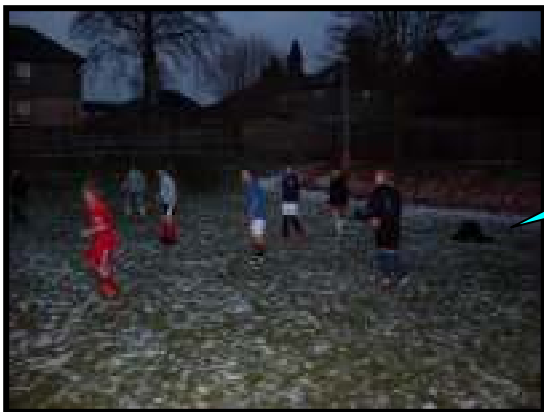
Football Club - whatever the weather!